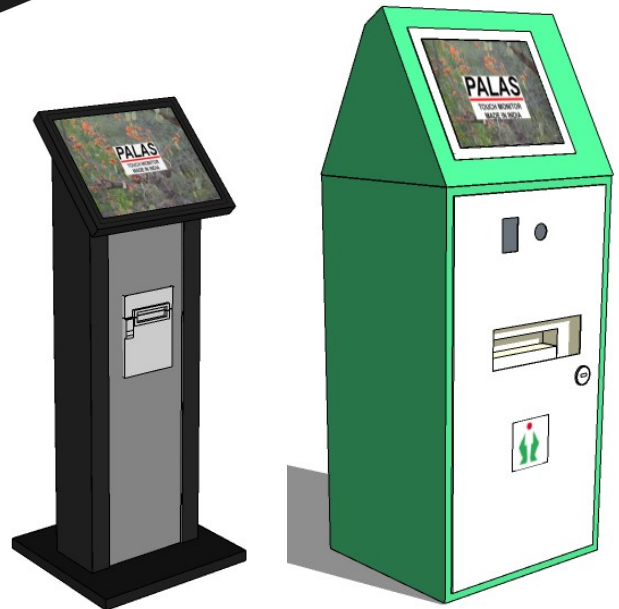
With 80mm thermal printer