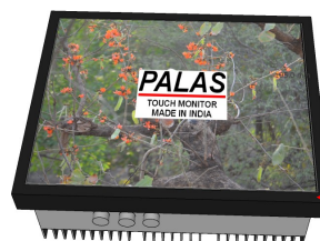
Model 170BCxM-xx-Sx fully sealed, not affected by smoke, oil, water. Ideal for Kitchen use