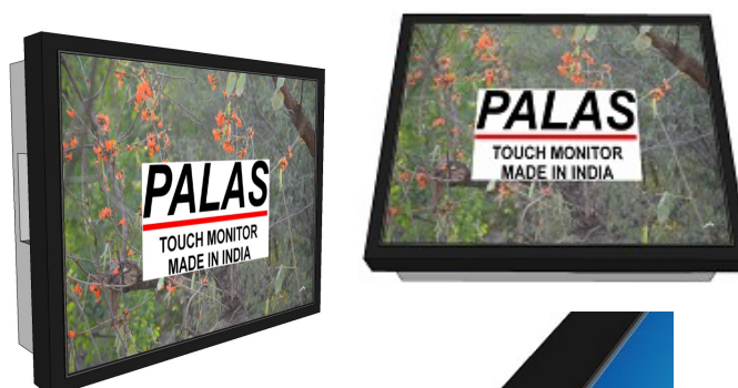
Model 170BCxM-F (with flange) for panel mounting

Unique metal frame PCs for use in harsh environments. Rugged design. Easy mounting through VESA mounts. Anti-reflective.