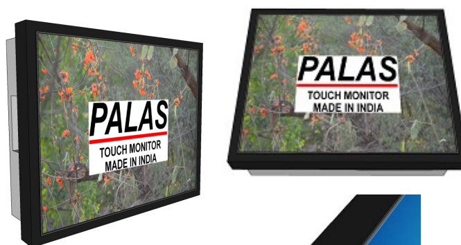
Model 170BCxM-F (with flange) for panel mounting

Unique metal frame PCs for use in harsh environments. Rugged design. Easy mounting through VESA mounts. Anti-reflective.