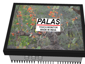
Model 170BCxM-xx-Sx fully sealed, not affected by smoke, oil, water