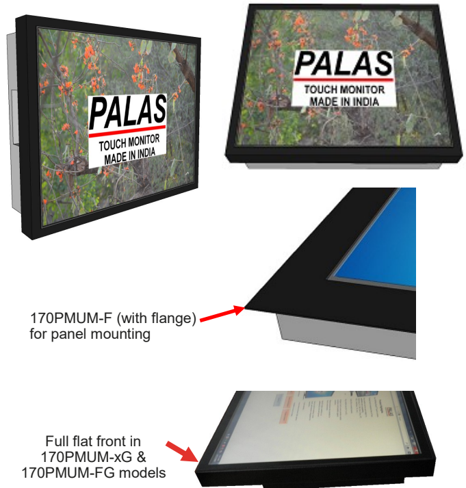
170PMUM-F (with flange) for panel mounting

Unique metal frame PCs for use in harsh environments. Rugged design. Easy mounting through VESA mounts. Smooth, easy-glide surface coating. Anti-reflective.