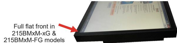
Full flat front in 215BMxM-xG & 215BMxM-FG models