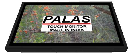
240BMxM-F (with flange) for panel mounting