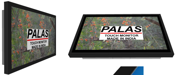
270BMxM-Fx-U (with flange) for panel mounting

Unique metal frame PCs for use in harsh environments. Rugged design. Easy mounting through VESA mounts. Smooth, easy-glide surface coating. Anti-reflective.