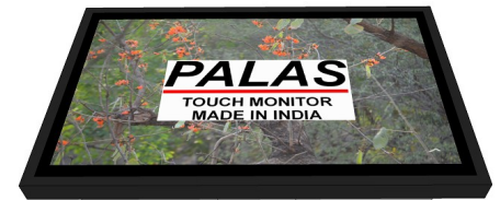
320BMxM-Fx-U (with flange) for panel mounting