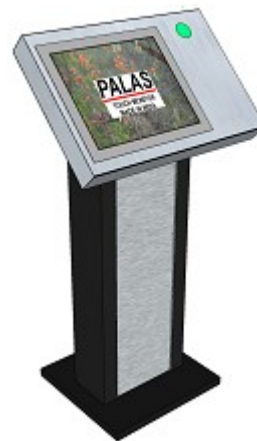
With Floor Mount without printer