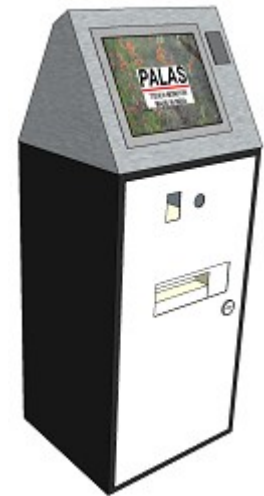
With A4 printer