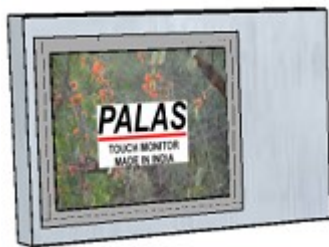
Keep on table or mount on wall