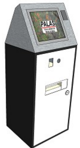
With A4 printer