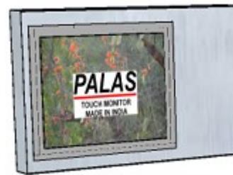
Keep on table or mount on wall

Prices start at only Rs 99,400 (for wall mount 17" system, without scanner. GST extra at 18%)